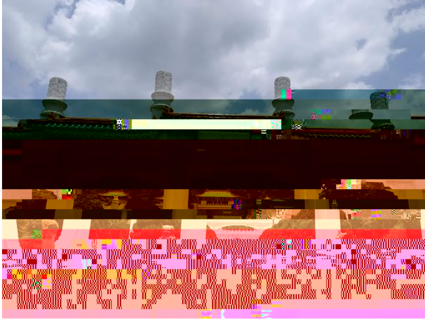
The National Palace Museum in Taipei, Taiwan