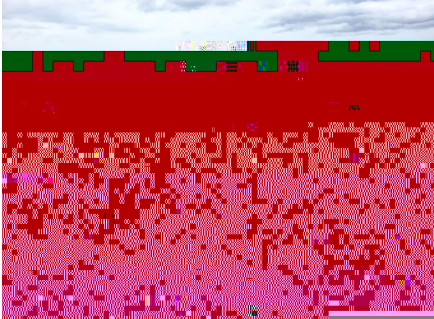
Jin Shui Mountain Roads in Jinguashi, Taiwan